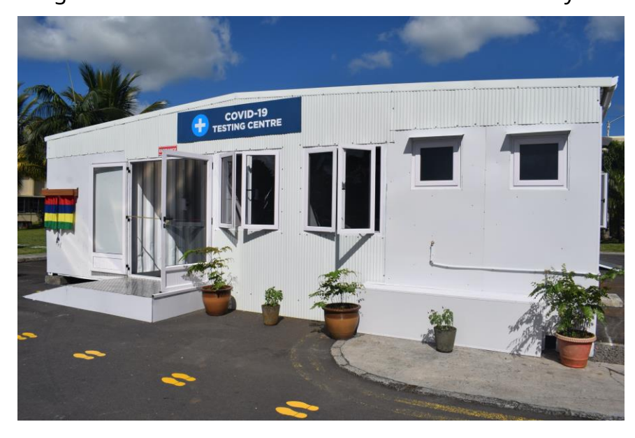
Mauritius, Screening facility with two isolation units in front Regional Hospital. Built by Ministry of Health and Wellness supported by WHO. Jun 2020.

working with one of the largest hospitals in Bologna (with +2000 bed capacity), to review and restructure the public health system to increase resiliency, flexibility and responsiveness to health emergencies. The new standards and designs applied in this project aim to serve as a Hospital of the Future model for clinical care for patients not only during the COVID-19 pandemic but also in future health emergencies.