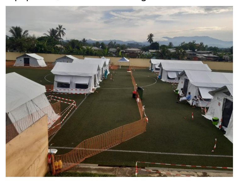
São Tomé e Principe, COVID-19 Treatment Center with 50 beds capacity built by Ministry of Health supported by WHO and Emergency Medical Team. May 2020.

In collaboration with WHO health operations and technical experts, assistance may also extend to providing recommendations for oxygen supply strategies and clinical care equipment, as well as training for medical and non-medical personnel.